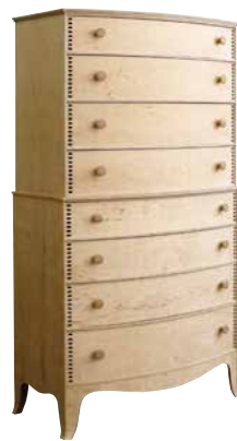
Tallboy R36 822, James Mudge

DECO TIP >>> An open steel-base wardrobe looks amazing in corners and doesn't take up a lot of room.