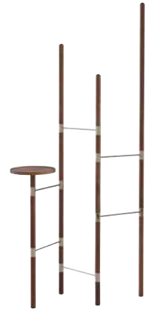
Estonia by Buseti Garuti Redaelli R14 595, Ligne Roset