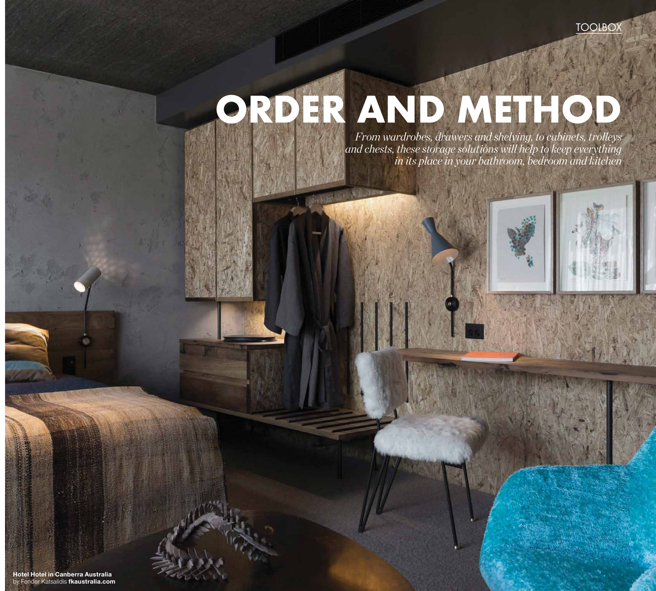
Hotel Hotel in Canberra Australia by Fender Katsalidis fkaustralia.com

From wardrobes, drawers and shelving, to cabinets, trolleys and chests, these storage solutions will help to keep everything in its place in your bathroom, bedroom and kitchen