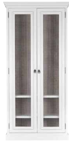
Maison Wardrobe R15 995, SHF