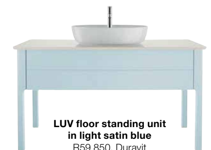
LUV floor standing unit in light satin blue R59 850, Duravit