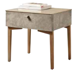
Gamma K07 pedestal R27 000, Casarredo