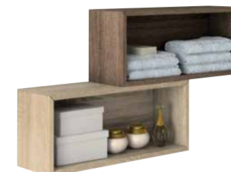
Castellon Britannia wood floating cube R1 990 each, Italtile