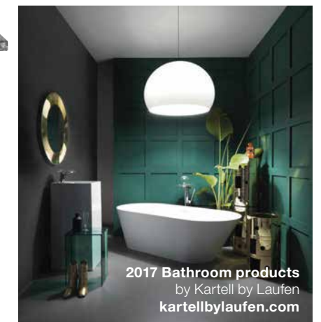
2017 Bathroom products by Kartell by Laufen kartellbylaufen.com

Built-in shelving is the perfect solution in a smaller bathroom.