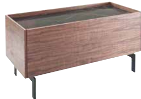
Marsi pedestal R24 000, Tonic Design