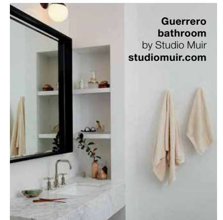
Guerrero bathroom by Studio Muir studiomuir.com