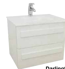
Darlington 990 W/H unit R4 690, Bathroom Bizarre