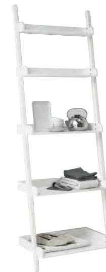
Stairs by Agape R20 292, LAVO Bathroom Concepts